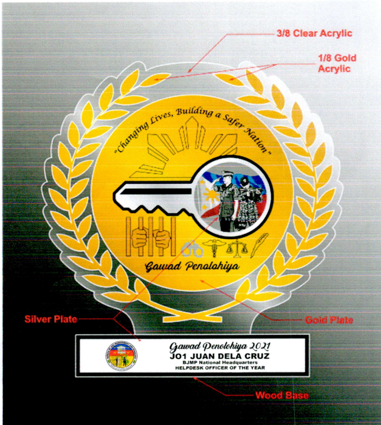
Gawad Penolohiya Plaque Specification